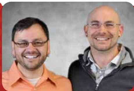
PrideFest Production Volunteers Extraordinaire