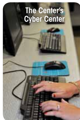
The Center's Cyber Center

With the creation of The Transgender Career Advancement Project, The Center hopes to increase participation in all computer classes.