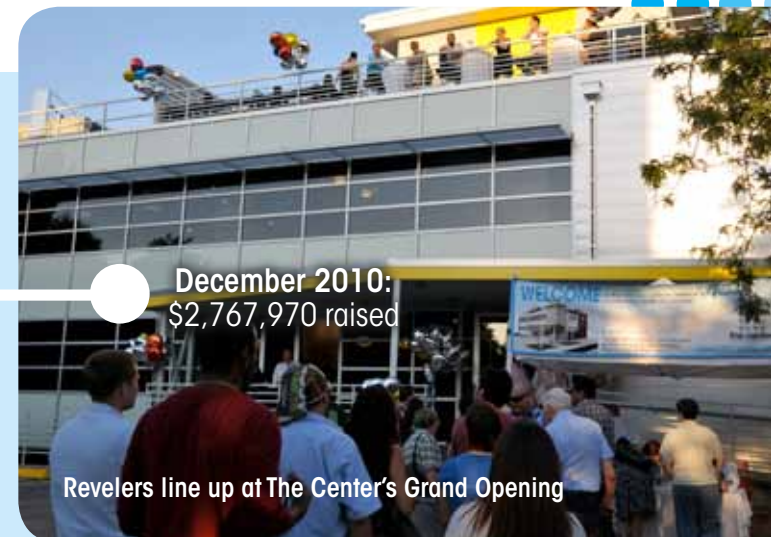
December 2010: $2,767,970 raised

September 2010: 1,000 community members enjoy the Grand Opening Celebration