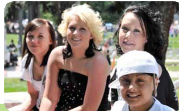
Youth Alley at PrideFest

In addition to regular programming, Rainbow Alley offers special events throughout the year, cosponsoring the annual Queer Youth Summit in February, throwing Queer Prom in May, hosting Youth Alley at PrideFest in June and the annual fundraiser, Gaybutante, in October, which honors youth who share their inspiring coming-out stories in front of a large group of supportive adults.