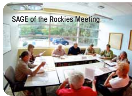
SAGE of the Rockies Meeting

In addition to these highlights, SAGE of the Rockies continued to host its regular programs. Each week elders congregated at The Center for Tuesday Morning Coffee, an informal gathering of conversation and support, a caregivers support group, and a grief support group for those who have lost a partner. SAGE of the Rockies also offered workshops on medication management with a Geriatric Pharmacist, a safe driving course offered in conjunction with AARP, financial planning seminars, and yoga classes. Elders from SAGE of the Rockies also attended four Breakfast and The Opera outings, watching recorded performances from the New York Metropolitan Opera in a movie theater, as well a special viewing of the King Tut exhibition at the Denver Art Museum. SAGE of the Rockies has created an active and vibrant community of LGBT elders, fighting isolation among them and enhancing the quality of life for all. •