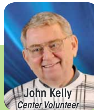
John Kelly Center Volunteer

The Center's Legal Helpline assisted with over 330 contacts seeking basic information or referrals to LGBT-friendly attorneys or agencies. The majority of contacts are provided with referrals or basic information over the phone. The Legal Helpline this year created Spanish language forms to increase the effectiveness of our work. Throughout the year the program utilized the talents of seven interns from both University of Colorado and University of Denver law schools, and introduced them to the world of LGBT advocacy and legal work, planting the seeds for the next generation to undertake the fight for equality. Five of the interns handled intake on the Legal Helpline, while the others focused specifically on research for the direct representation case. •